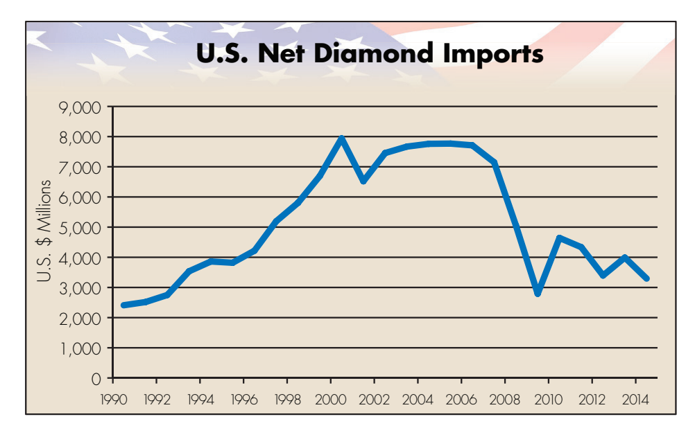
The U.S. has been relatively stable, but not booming.

our Rapaport Price List, but they are stabilizing. The fact that approximately 30 percent of rough was rejected at the last De Beers sight is comforting because it shows that the industry is behaving responsibly by reducing supply as demand declines. Furthermore, declining rough purchases reduce financial pressure on suppliers, making it less likely that they will have to sell off existing polished inventory at below market prices.