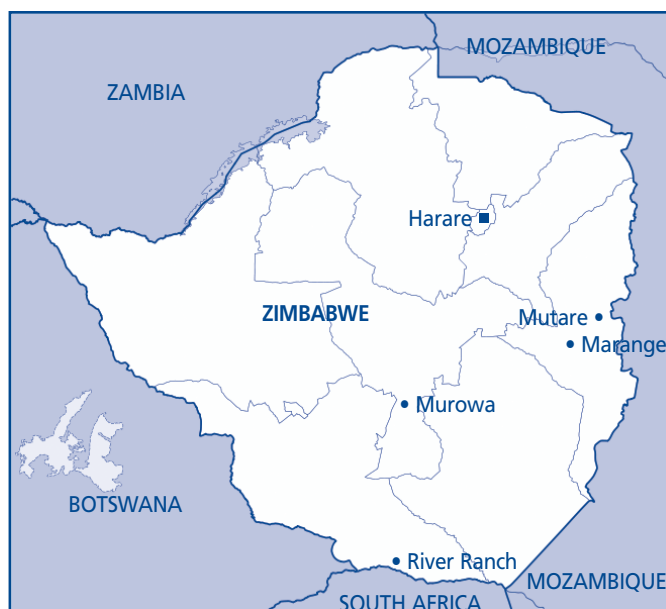
Map Showing Main Diamond Producing Sites in Zimbabwe

The Kimberley Process Working Group of Diamond Experts has produced a "footprint" of diamonds from Marange. 3 On first sight, it says, the diamonds look like gravel, "resembling rounded pebbles in a riverbed," or tumbled chips of broken beer bottles. There are two distinct qualities. About 90% are coarse, very low quality diamonds resembling rounded pebbles, with colours ranging from dark green to dark brown and black. Because of