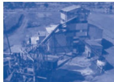
The Sorter at River Ranch

The Amsco assistance to River Ranch was controversial on several counts. First, Amsco was providing assistance to an operation that was embroiled in an ugly lawsuit charging wrongful takeover. Secondly, at least one of the principals, Solomon Mujuru, was the subject of international embargoes. And third, Rani International, a subsidiary of the giant Aujan Group of Companies,* was in absolutely no need of assistance from a foreign aid organization. The assistance included the provision of five people working