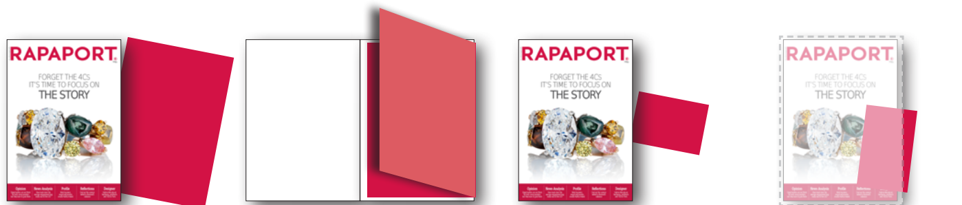
E. Thick insert